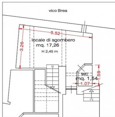
PIANTA PIANO TERRENO