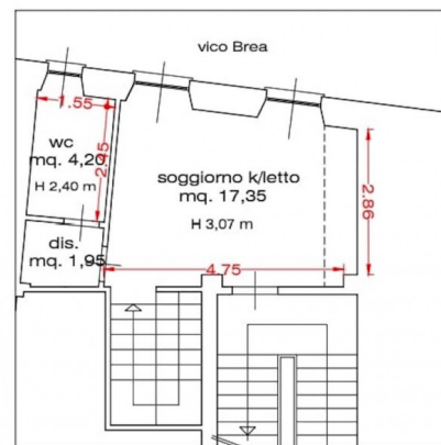
PIANTA PIANO PRIMO/AMEZZATO